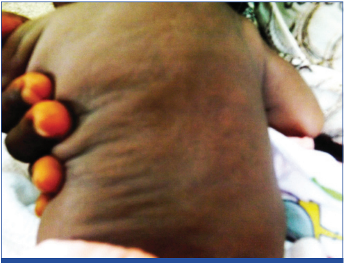
[Table/Fig-3]: Showing raised indurated Traumatic fat Necrosis lesion on the back.

and histiocytes. Some clefts were located between the adipocytes and the background was haemorrhagic. The micrograph of the aspirated tissue is shown in [Table/Fig-4].